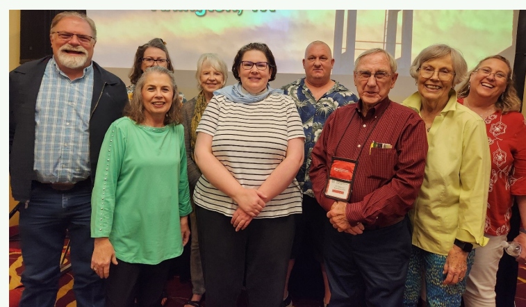
Beautiful Savior had a total of 9 members in attendance; 2 voting delegates, 2 visitors, 4 volunteers, and 1 pastor!

The Church finds itself in challenging times. Things are changing quickly and sometimes, we feel stuck. We are not sure how we should address all the issues that we face as people of faith; declining attendance, diminishing resources, political divisions, and theological debates. Attending events such as Synod Assembly reminds us that we are not alone as we navigate our new reality. With all the challenges and changes, the people of God stand on common ground, our faith in the risen Jesus Christ. Sometimes, we need a gentle nudge, a still small voice, which reminds us that we have more in common than we realize.